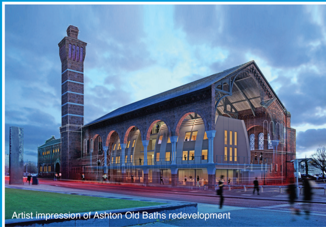
Artist impression of Ashton Old Baths redevelopment

By working together we can grow Tameside.