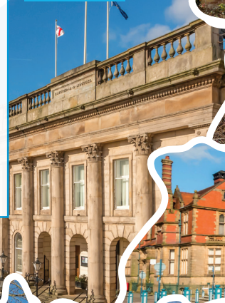
Ashton Town Hall