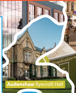
Audenshaw Ryecroft Hall